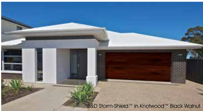
B&D Storm-Shield™ in Knotwood™ Black Walnut

Refer to the B&D website for the full colour range available.