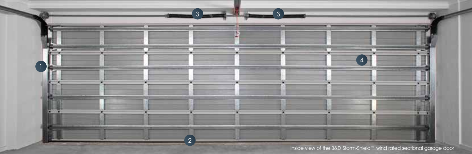
Inside view of the B&D Storm-Shield™ wind rated sectional garage door